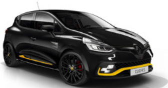
DIAMOND BLACK (METALLIC)